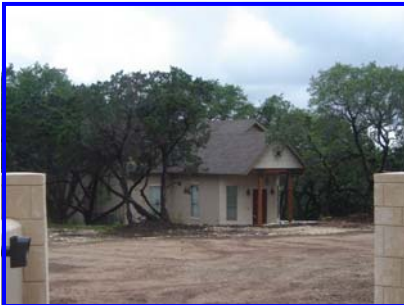
HIGH OAK — Hilltop home with beautiful views of the Hill Country on two acres, unrestricted use.