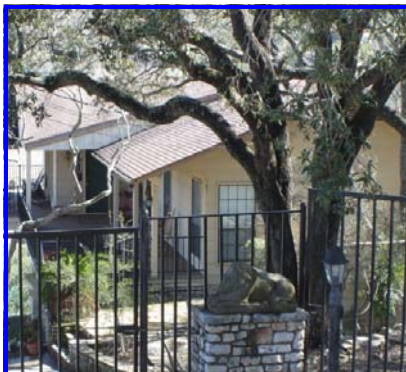
2142 CONNIE — Waterfront home on deep cove, perfect for swimming, kayaking, or fishing.