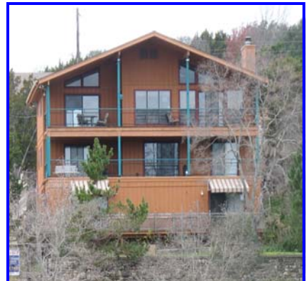
2090 COLLEEN — Great waterfront home with three living areas and huge decks to enjoy the Lake!